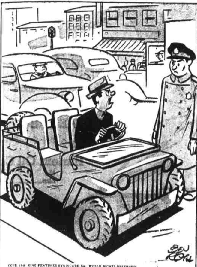
"This jeep broke through the German lines in Africa, Sicily and France, and you expect it to stop for a red light!"