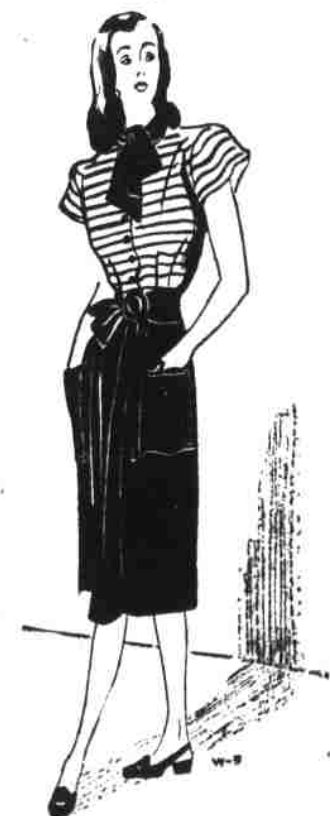
Navy skirt with striped top.