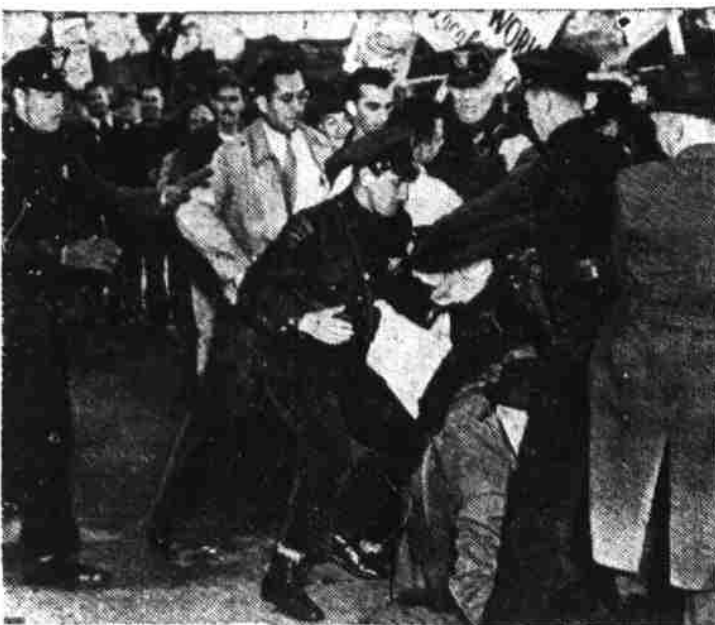
STATE POLICE COME TO AID OF NON-STRIKER