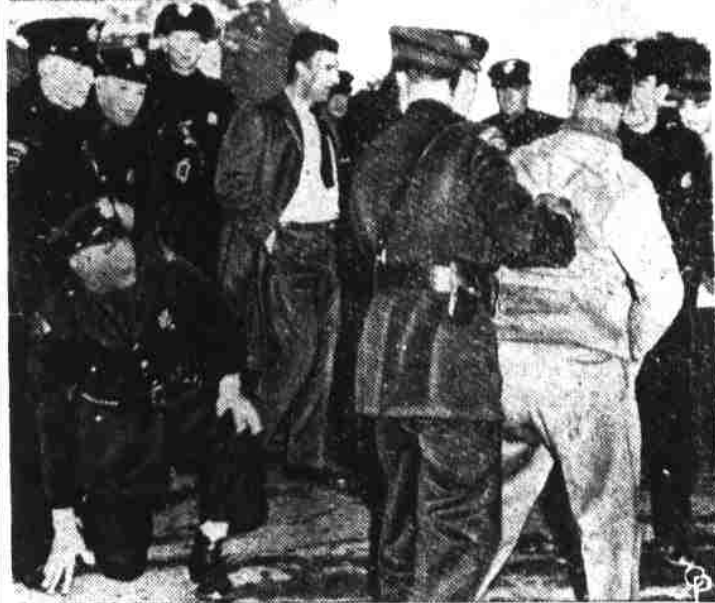
PICKETS AND POLICE CLASHED when the strike-bound Pratt and Whitney plant in West Hartford, Conn., reopened. Nearly a dozen union officials were arrested. State policemen came to the rescue (top) of one of the 900 non-union office workers, supervisors and foremen who attempted to break through the picket line to enter the plant. A sturdy striker (bottom) is about to be taken away by police after he had put in a few licks. One policeman is shown almost "taking the count."