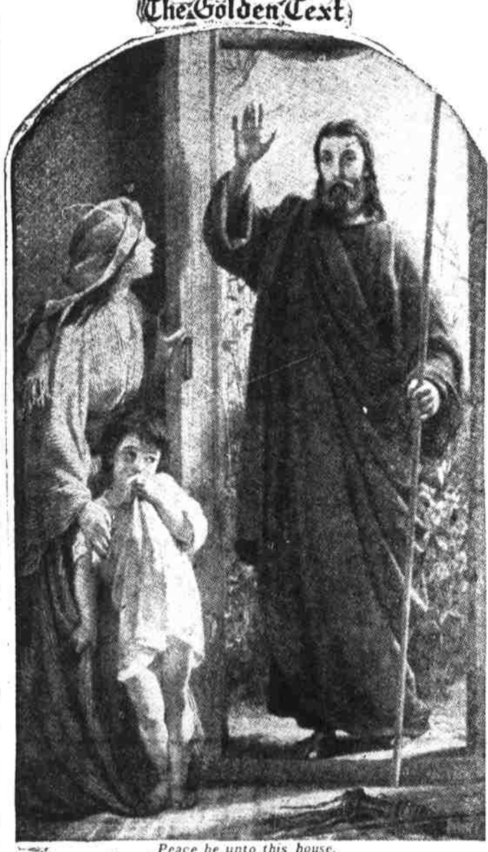
Peace be unto this house. By this shall all men know that ye are My disciples, if ye have love one to another.—John 13:35.

"Read it to be wise." It is given to you in life, will be opened at the judgment, and be remembered forever. It involves the highest responsibility.