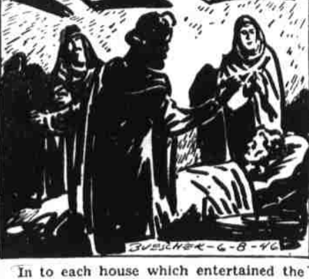
In to each house which entertained the disciples, they were to eat and drink such things as they were given.