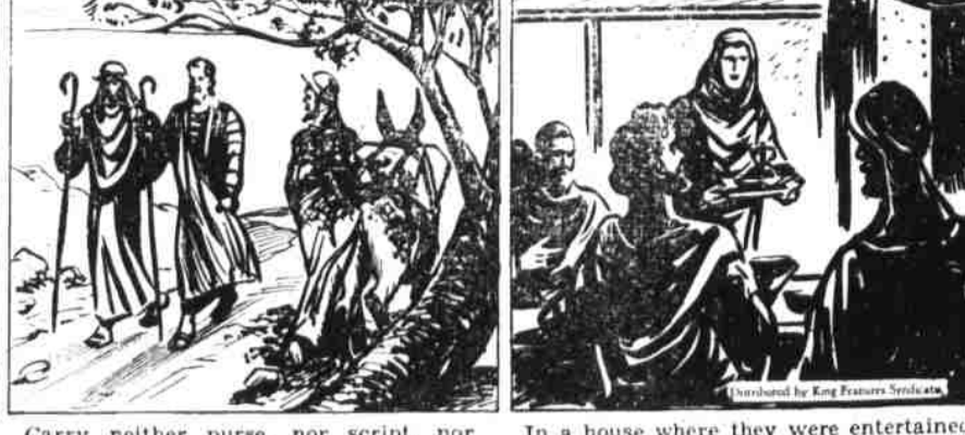
Carry neither purse, nor scrip, nor shoes: and salute no man by the way, Jesus commanded His disciples.