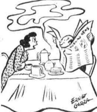
"What d'ya mean—What did I say just now? That was YESTERDAY!"