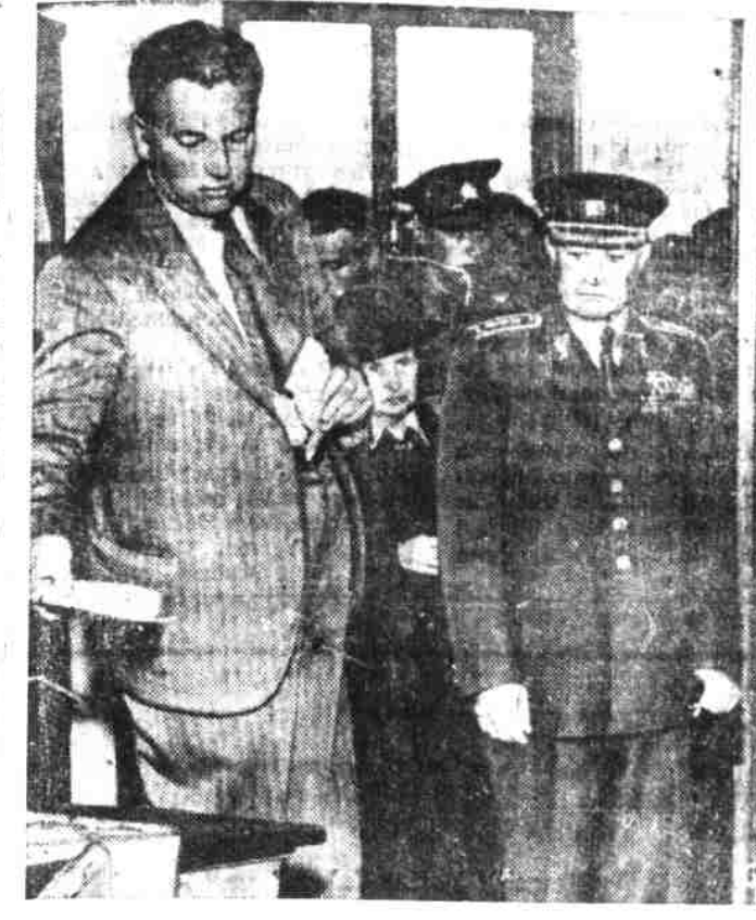
STANDING READY TO CAST his vote in the Czechorlovakian general election, Gen. Svoboda, Czech Minister of War, is shown in a queue of voters at the polls in Prague, The results, which were watched with world interest, showed great left wing strength.