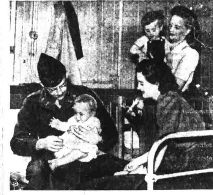
ONE OF THE U. S. MEDICAL EXPERTS seeking the cause of the malady responsible for the death of 14 babies of G1 brides, Capt. Wayne Rayson is shown here in Tidworth, England, holding a baby while its mother, together with other mothers, is interviewed.