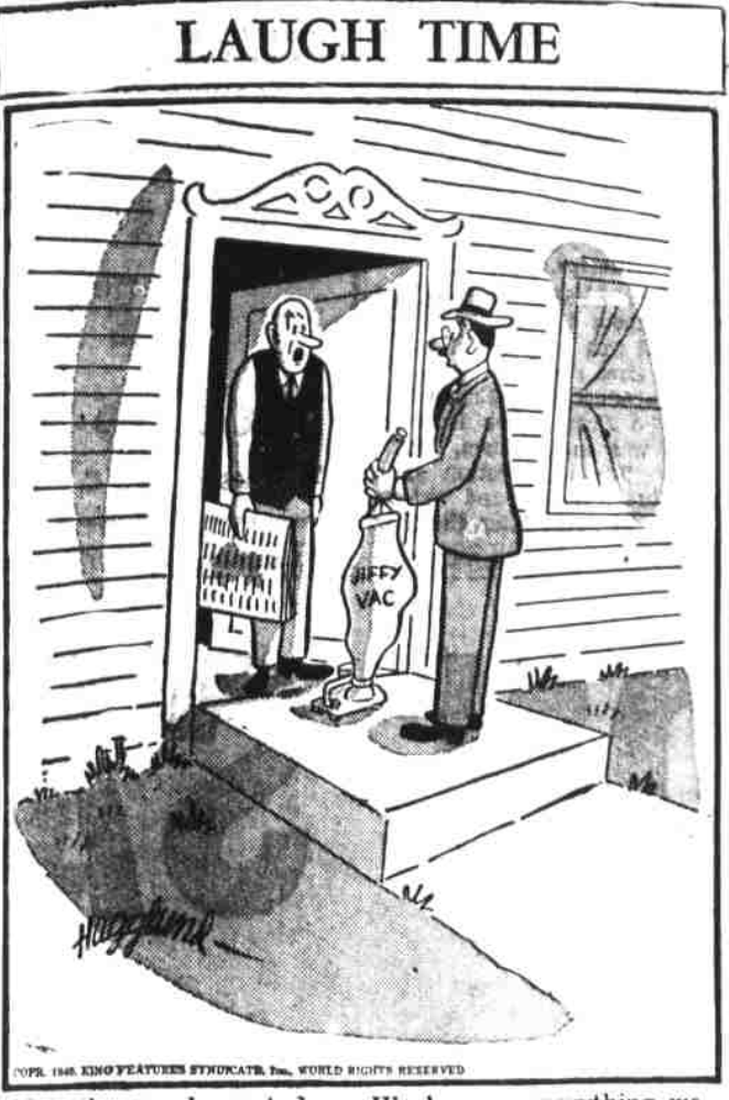
"See the people next door. We borrow everything we need from them!"

Salary --- Steady Job for Salesman (Or Saleslady) Haywood County. Must have car. Mileage to good salary. ening just being created by an old established ille. n by letter, addressed to "Opportunity" ainer.