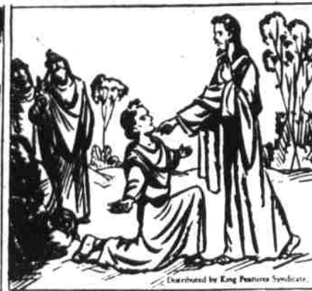
A young man ran to Jesus and knelt before Him, calling Him "Good Master." Jesus asked, "Why callest thou Me good? There is none good but one, that is God."