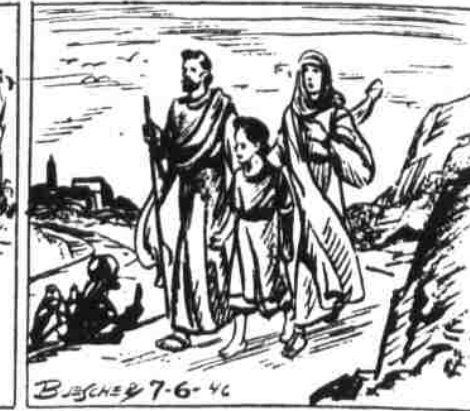
Every year Jesus' parents went to Jerusalem to the feast of the Passover, and when Jesus was twelve years old He went with them.