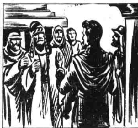
A lawyer asked Jesus which was the greatest commandment in the law, and Jesus answered, "Thou shalt love the Lord thy God with all thy heart, mind and soul."