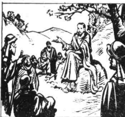
On the Mount of Olives Jesus taught His disciples, "Let your light so shine before men, that they may see your good works, and glorify your Father which is in heaven."