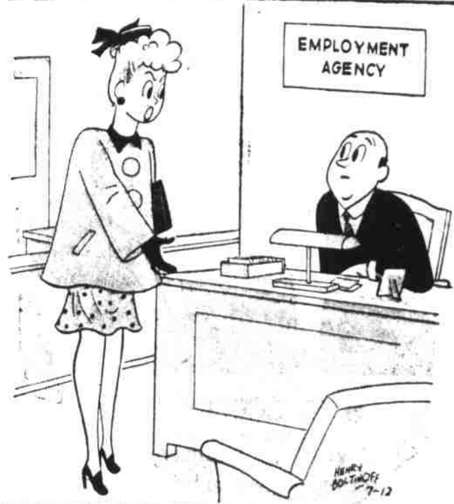
"I want another job! The boss on the last one is happily married!"