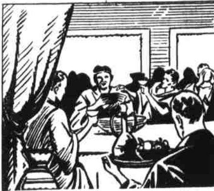
"When thy herds and flocks multiply, and thy silver and thy gold is multiplied, and all that thou hast is multiplied, then perchance thou wilt forget the Lord thy God."