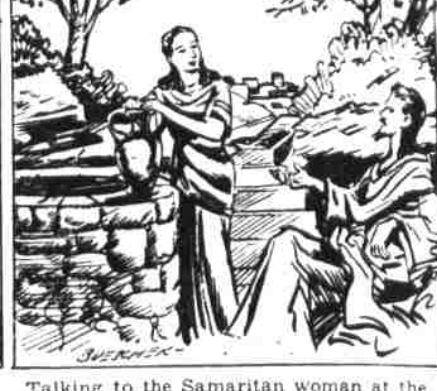
Talking to the Samaritan woman at the well, Jesus told her, "The hour cometh when the true worshiper shall worship the Father in spirit and in truth." MEMORY VERSE—Luke 4:8.