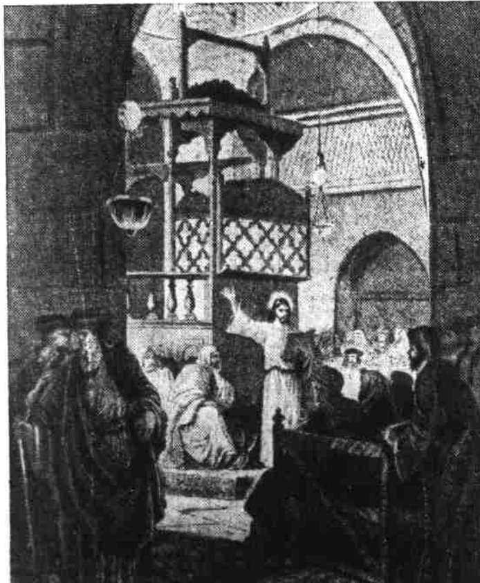
Christ teaching in the synagogue at Capernaum. "Thou shalt worship the Lord thy God, and Him only shalt thou serve."—Luke 4:8.