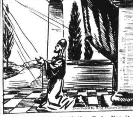
"Remember the Lord thy God: For it is He that giveth thee power to get wealth... and if thou do forget and walk after other gods and serve them, ye shall surely perish."