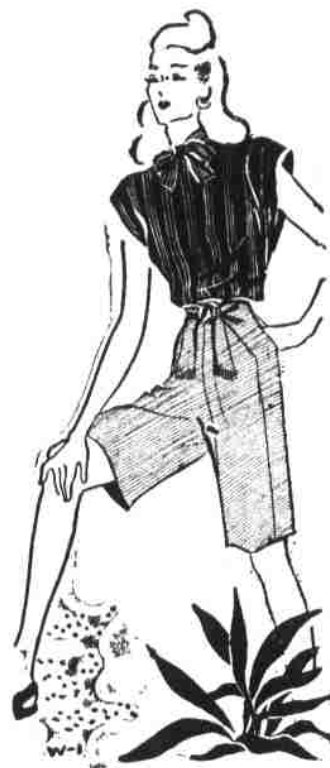
For western resort wear. By VERA WINSTON

THIS IS the sort of outfit that is just the thing at western resorts. A navy and white striped blouse of spun rayon has loose cap sleeves and a band neckline that ties in a bow.