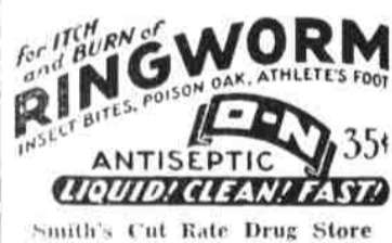
Smith's Cut Rate Drug Store