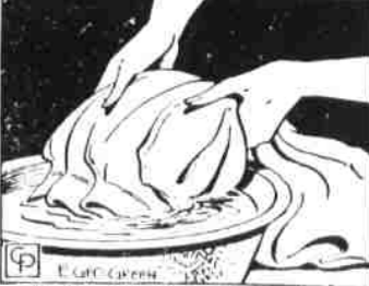
To get uniform results in starching shirts gather all the parts to be starched together and dip them into the starch at the same time. Be careful not to use too much starch, as it will crack the fiber threads and cause the shirt to wear out faster.