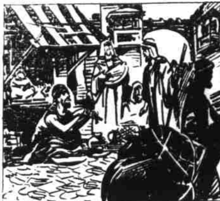
"There dwelt men of Tyre also therein, which brought fish, and all manner of ware, and sold them on the sabbath unto the children of Judah, and in Jerusalem, and I contended with them."