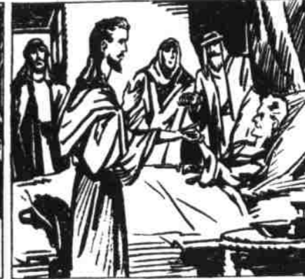
Simon's wife's mother lay sick of a fever, and anon they tell Him of her. And He came and took her by the hand, and lifted her up and immediately the fever left her.