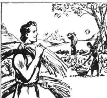
"In those days I saw in Judah some treading wine presses on the sabbath, and bringing in sheaves, and lading asses with all manner of burdens, which they brought into Jerusalem."

Scriptures—Exodus 20:8-11; Neh. 13:15-18; Psalms 92:1-2; 118:24; Matt. 12:9-13; Mark 1:21-34; 2:23-28; 3:1-5.