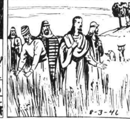
The Pharisees complained that Jesus and His disciples were breaking the sabbath. Jesus said, "The sabbath was made for man, not man for the sabbath." MEMORY VERSE—Psalm 118:24.