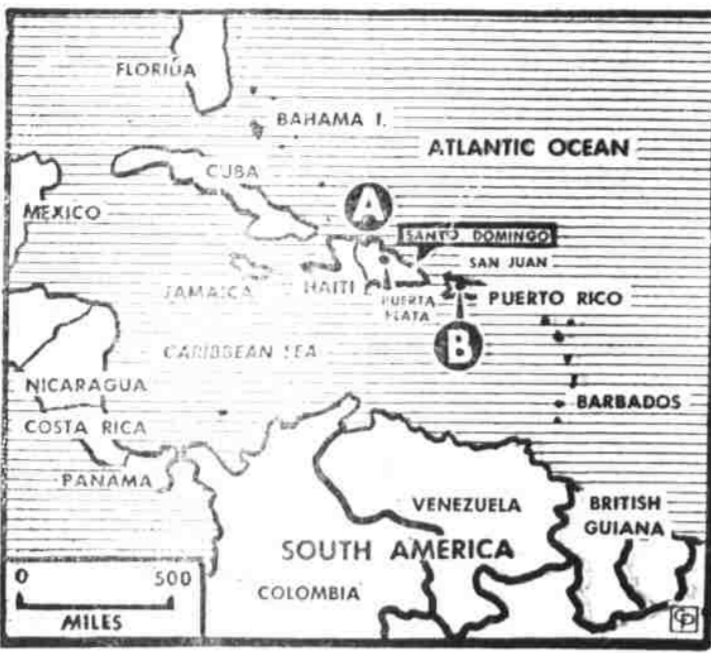
FOLLOWING THE CARIBBEAN EARTHQUAKE, which spanned a 600 mile stretch of the West Indies, a huge tidal wave hit Puerto Plata (A) a seaport on the north coast of Santo Domingo. Other small coast towns were damaged. All sections of the island felt the quake and in San Juan, Puerto Rico (B) several persons were reported hurt.