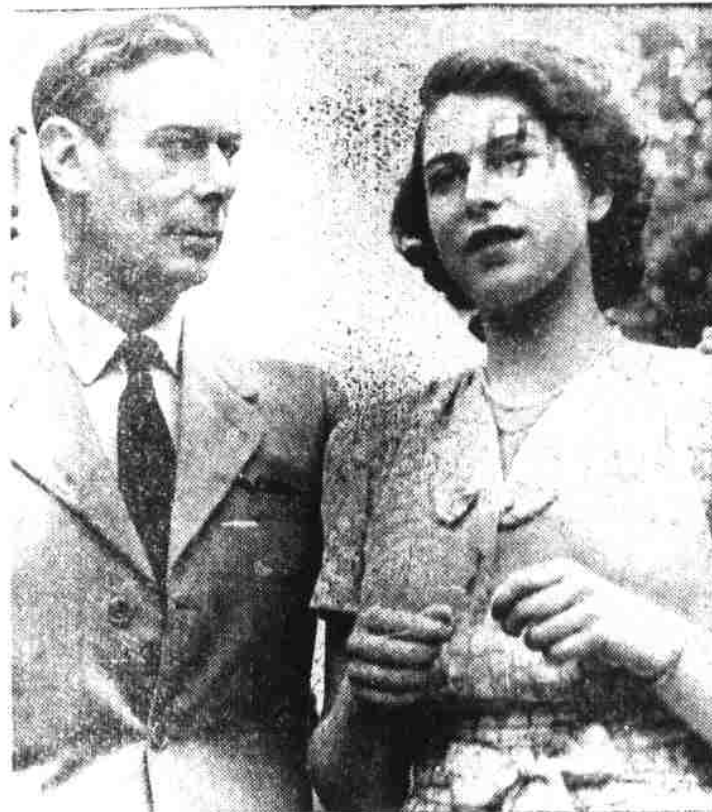
TAKING A STROLL in the gardens of the royal lodge at Windsor are father and daughter, King George VI of England and Princess Elizabeth. Her preambly to the throne, the princess is undergoing training for that exacting duty, and fully realizes her responsibilities.