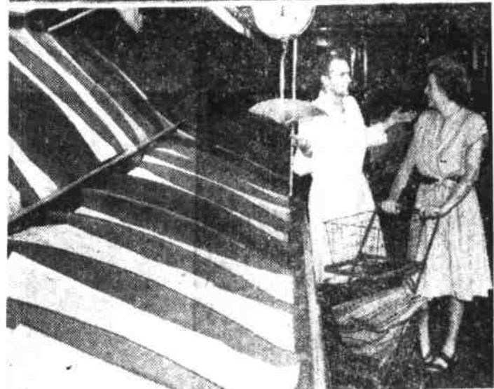
"I'VE GOT PLENTY of Nothing" threatened to become the theme song of New York as the metropolis was tied up by a truck strike on land and a maritime strike on the waterfront.