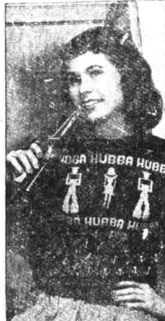
MEANINGFUL for the sweater crowd! Navy and white jacquard pullover with designing design!