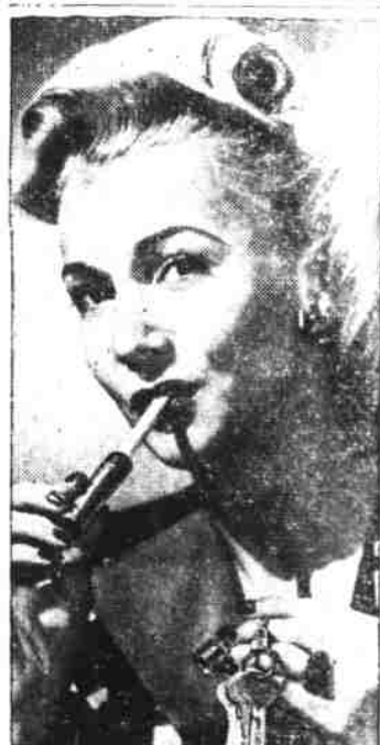
TWIN ACCESSORY—the stirrup-model key chain has a Lektrolite Flameless cigarette lighter (with fluid) attached. Carole Landis shows how.

On American development of military weapons, General Eisenhower said he believed present-day rocket bombs and other guided missiles were comparable to the