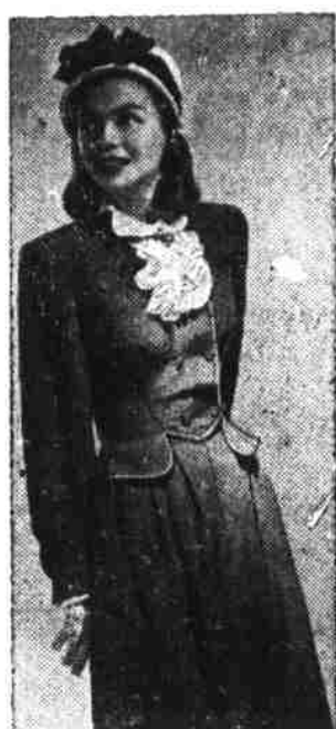
DANDY SUIT with cut-away jacket, frilly jabot, cuffed sleeves, full skirt; of Crown tested rayon faille.