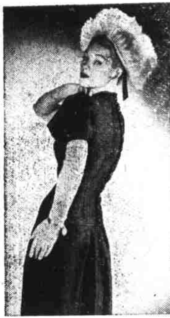
ALL A-BUSTLE in a dress of dull surface sheen satin made of Du Pont acetate rayon. Pull sleeves and buttons down the back are sweet revivals!