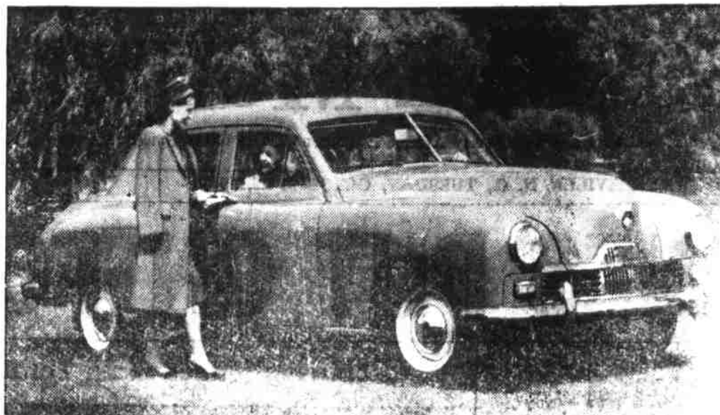
This is the new six-passenger 109-horsepower Kaiser car which is being shown here this week by Lyda Motor Company at the corner of Depot and Haywood streets.