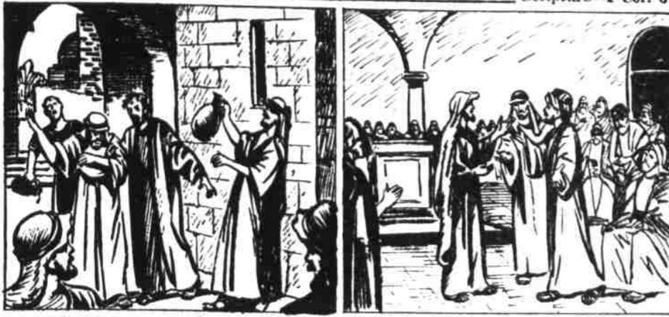
"Nor thieves, nor covetous, nor drunkards, nor revilers, nor extortioners, shall inherit the kingdom of God."

Scripture—I Cor. 6:9a-10; 11:17-27; Romans 13:13-14; Ephes. 5:18-21.