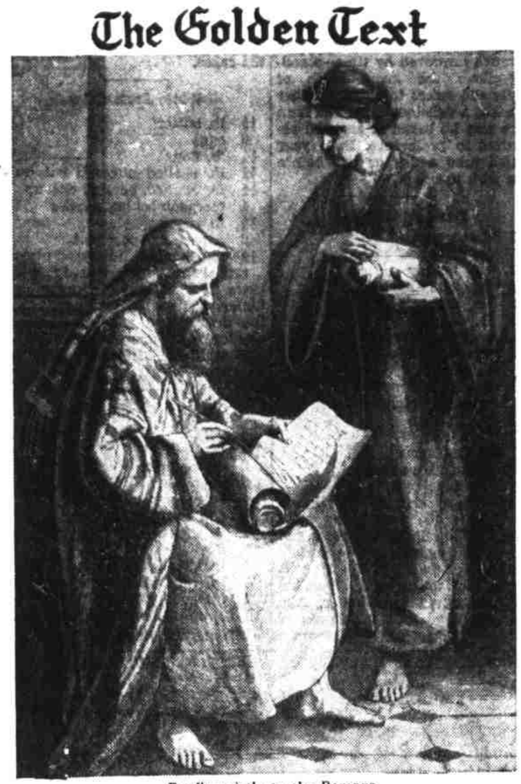
Paul's epistle to the Romans. "Teach me Thy way, Jehovah."—Psalm 27:11.

utes, we then should stay near the telephone and await the call. We should put as much courtesy and consideration into a telephone call, as in a personal visit or conference. It is easier on the disposition, the nerves, may save friendship and even money. The Golden Rule has excellent application in our use of the telephone. Too many of us leave it in the Bible, while it ought to be taken out and put to use.