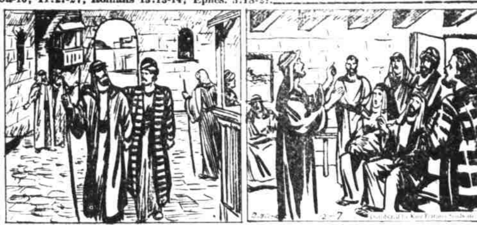
"Let us walk honestly, as in the day; not in rioting and drunkenness, not in strife and envying."