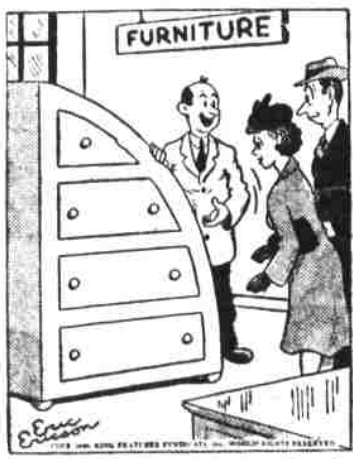
"It's especially designed for Quonset huts!"