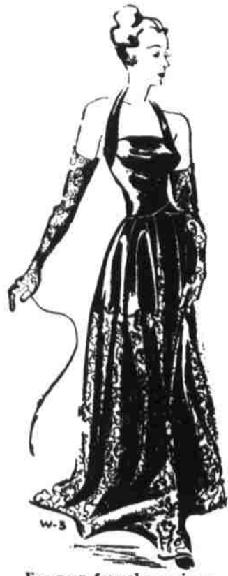
For very formal occasions.