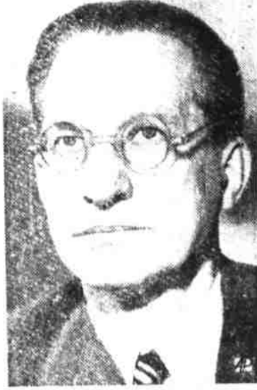
ALCIDE DE GASPERI Italy