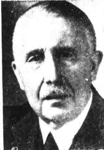
EDWARD VON STEIGER Switzerland