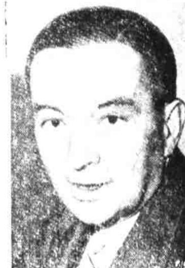
GEORGES BIDAULT France