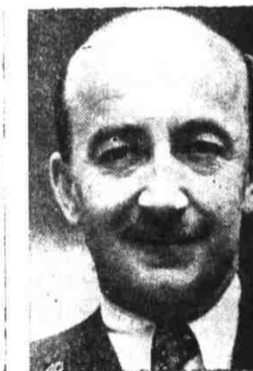
FERENC NAGY Hungary