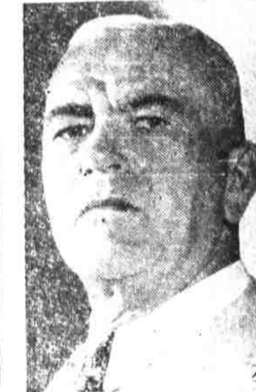
DR. PETRU GROZA Romania