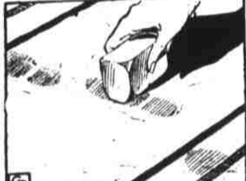
Use art gum to remove sooty footprints on light colored rugs.