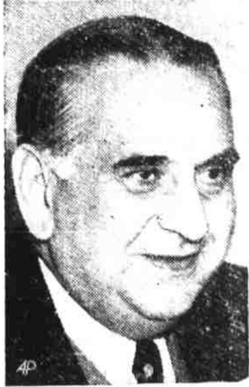
CONSTANTIN TSALDARIS Greece

DO YOU KNOW THESE FACES? They are the political leaders of European nations around which international disputes are raging. As present or past heads of governments their decisions may be vital in world affairs.