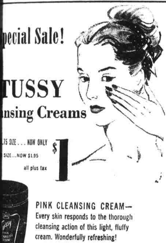
Every skin responds to the thorough cleansing action of this light, fluffy cream. Wonderfully refreshing!