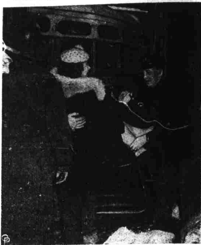
ONE OF FOURTEEN persons injured when a Maywood, N. J., bus crashed into an Eighth Avenue line bus in mid-New York, an unidentified woman is carried from the wrecked vehicle. Icy streets and storm-damaged signal lights caused the accident. Occupants of the local bus were trapped for more than an hour in the vehicle.

my life. It's only when a nurse turns it off that I realize the bed was moving."