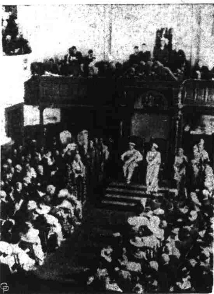
DURING THEIR VISIT to South Africa, King George VI and Queen Elizabeth both attended the opening session of the ninth Parliament of the Union of South Africa at Capetown. Here the Queen addresses the chamber as the King occupies the throne chair.