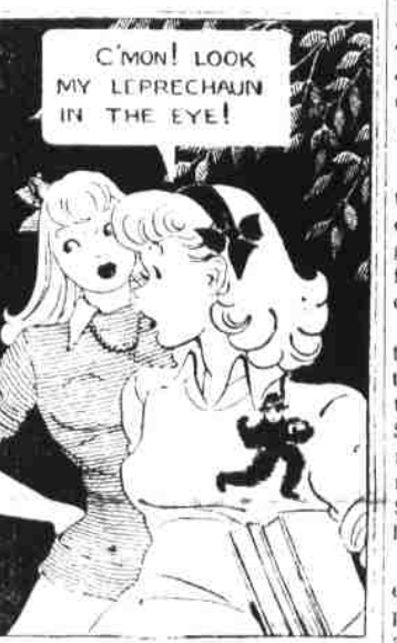
C'MON! LOOK MY LEPRECHAUN IN THE EYE!

How do you feel about the "little people?" The kids here are all excited about leprechauns. It all started with the play "Finian's Rainbow" in which there is leprechaun prancing around the stage. Now the kids are wearing leprechauns on their lapels. And the little kids have big leprechauns which they can bounce on an elastic string. Leprechauns are supposed to be good luck and here is the version of one ancient Irishman: "The little people are really little fairies who are still Irish shoemakers. But, unlike other shoemakers, the leprechauns will mend only the left shoe believing people should stand on their own two feet. Leprechauns like people, but they don't like other leprechauns and they don't like to be stared at. They will give you anything you ask for if you look them straight in the eye but they definitely do not like to be ogled. So now the kids go around madly staring into each other's eyes to see who can stare the longest. The one who wins is a