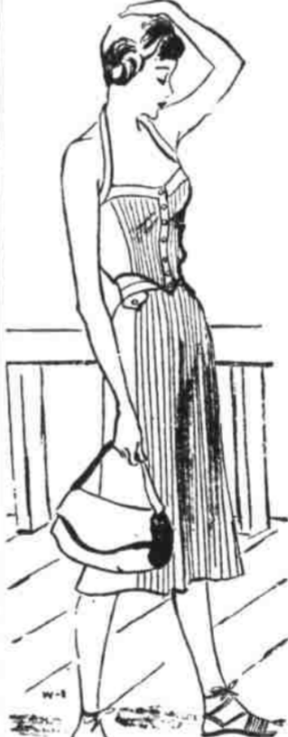
Interchangeable sharkskin outfit.

By VERA WINSTON COLORS AND fabrics may come and go, but for beach wear, there's still nothing to outshine crisp, spanking white sharkskin. It is used for this neat and useful interchangeable three-piece beach costume. The halter top which buttons on in front, is buttoned in, both front and back to either the simple, pin-tucked bathing shorts beneath or to the simple skirt with pin-tucked front panel. The back of the skirt is gored, and the back of the halter is plain.