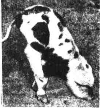
"TWO LEGGED" PIG of Topeka, Kas., could not walk normally when her rear legs swelled. She devised this technique of walking.