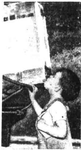
TIME FOR REFRESHMENT