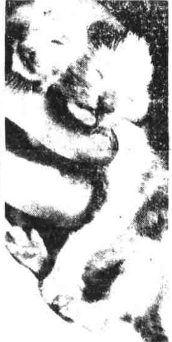
TWO HEADED KITTEN has four eyes, two mouths but only two ears. It was born in New York.