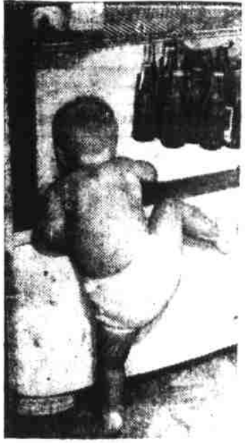
KITCHEN KILLIE KOOLER