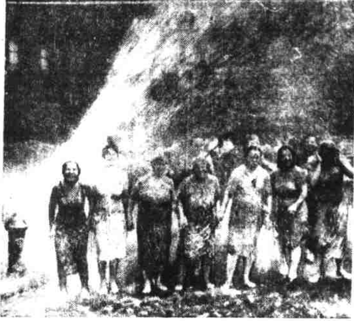
SIWALK SPARY FOR GROWN-UP CHILDREN