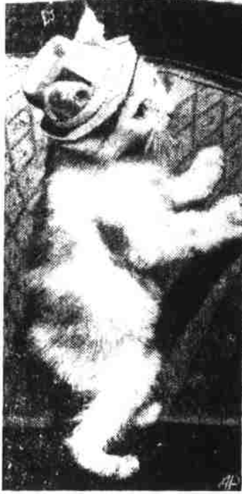
TAILLESS TABBY of Wilkesboro, N. C., with hindfeet resembling a rabbit's, was disowned by its mother.