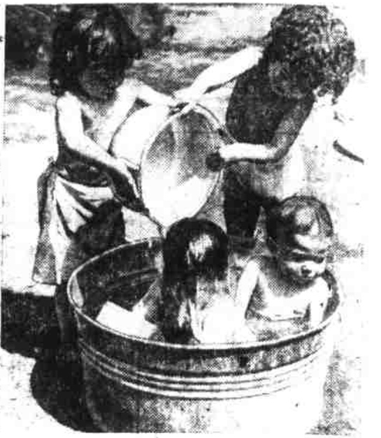
HOME MADE SWIMMING POOL