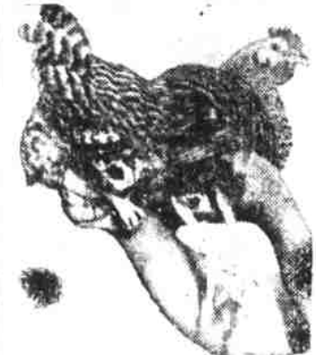
FOUR LEGGED CHICKEN of Brooklyn also has a twin tail and double egg laying apparatus.

Things have not been going according to plan in the animal world this year, either. Witness these freaks of 1947: