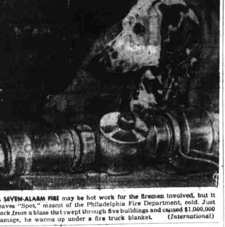
A SEVEN-ALARM FIRE may be hot work for the firemen involved, but it leaves "Spot," mascot of the Philadelphia Fire Department, cold.