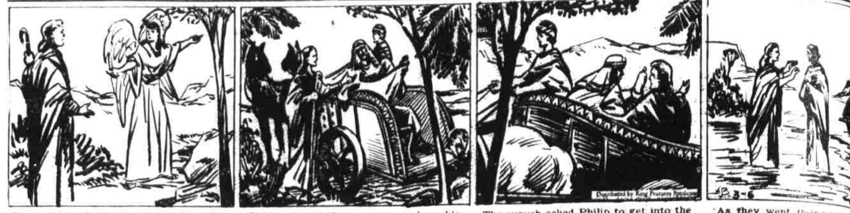
In a time of great persecution, the angel of the Lord appeared to Philip, saying, "Arise, and go toward the south unto the way that goeth down from Jerusalem unto Gaza." Philip obeyed the message, and on his way he encountered a eunuch, an Ethiopian, one who had great authority with the queen, sitting in his chariot reading the prophet Isaiah. The eunuch asked Philip to get into the chariot and explain a certain passage to him. Philip did so and then he "opened his mouth and began to preach the Gospel of Jesus." As they went their way they came to some water, and the eunuch asked that he be baptized, so both went into the water and Philip baptized him.