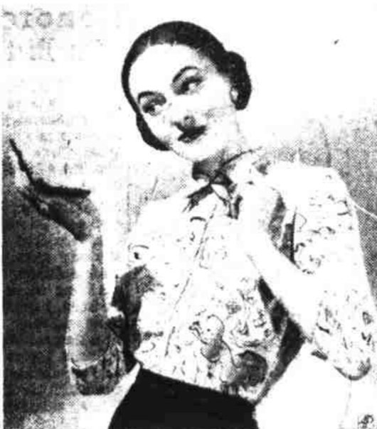
ANIMAL PRINT . . . Gay accent for a dark spring suit. Spun rayon blouse with shocking pink animals on a white ground.