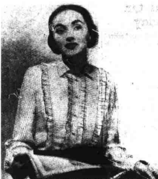
CANDY STRIPES . . . This one-denier spun rayon blouse looks like sheer linen, is washable and right for a tailored suit.