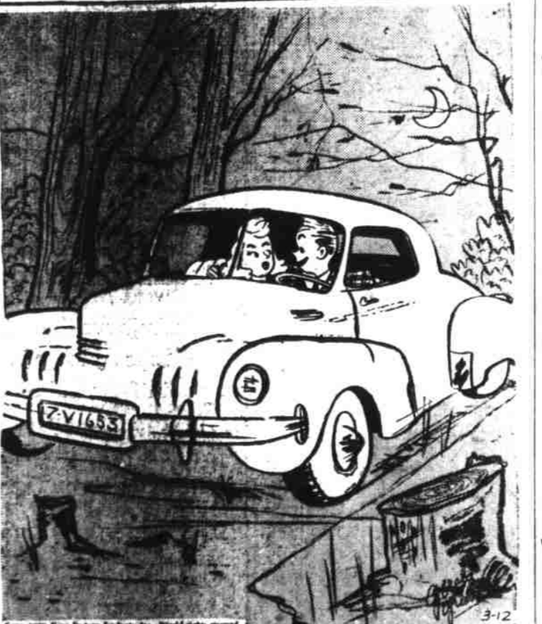
"Parents are funny, aren't they? Your mom sits up and worries about you, and my dad sits up and worries about the car."