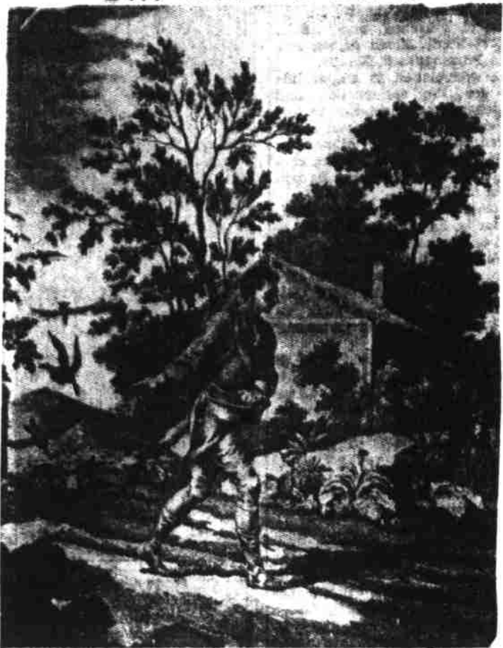
Parable of the sower.

"Ye rather, blessed are they that hear the word of God and keep it."—Luke 11:28.