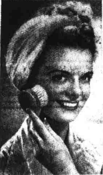
CLEAN SWEEP... a complexion brush (left) will help give a glow to her cheeks. A good bath brush (right) will lend exhilaration to the bath. Designed by Kent.