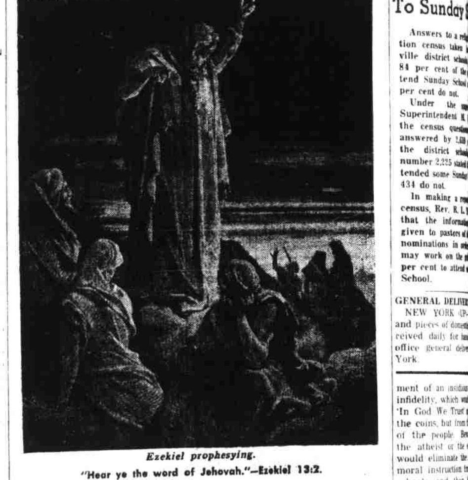
Ezekiel prophesying. "Hear ye the word of Jehovah."—Ezekiel 13:2.

Trust." We should revise The Star Spangled Banner, My Country 'Tis of Thee, and other national hymns, removing references to the Deity. Atheism is slipping up on us. I have just read a sermon preached in 1932, which contains this statement from a then current writer on constitutional law, "Christianity is a part of the law of the land . . . in this sense that many of our best social and civil institutions . . . are founded upon the Christian religion." The writer warns, "Beware of the encroach-