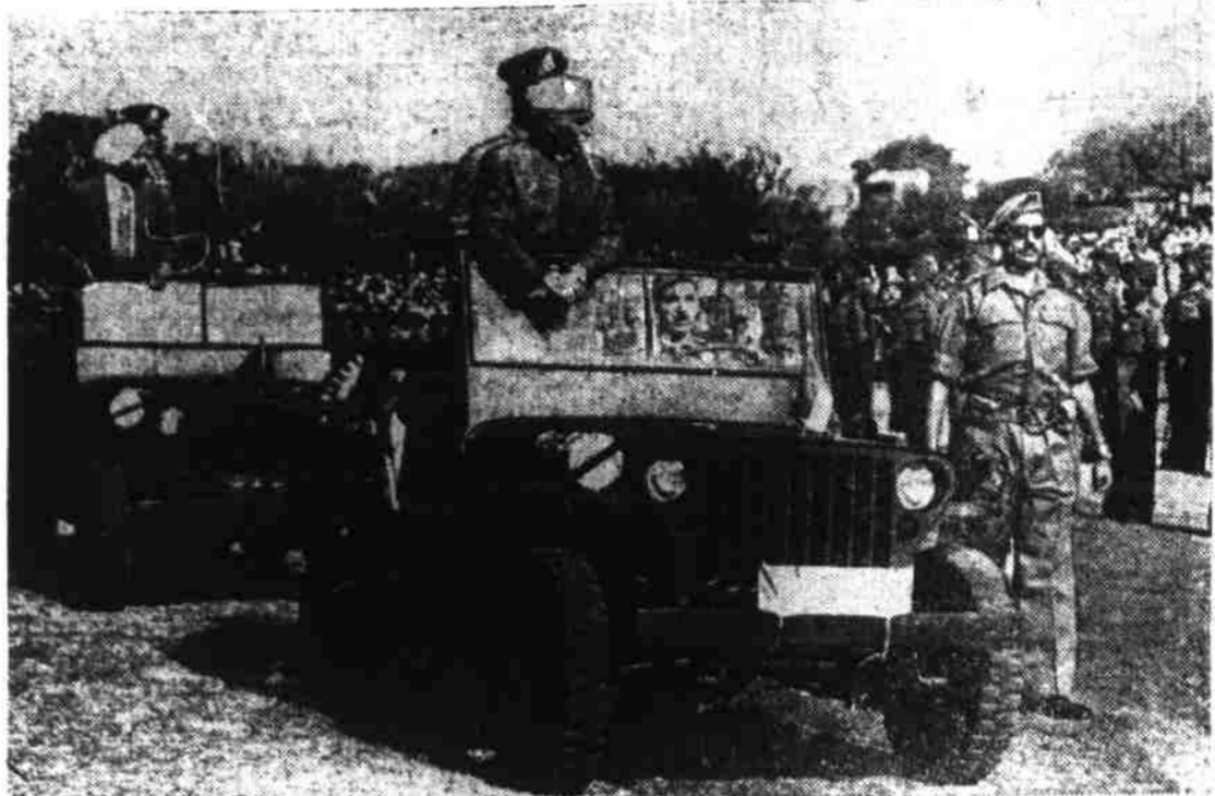
FIRST PRIME MINISTER OF INDIA, Pandit Jawaharlal Nehru (in first jeep) inspects a crack contingent of Indian troops during a ceremonial parade in Delhi. Seventeen army units of the Western Command, including the Governor General's bodyguard, took part in the military display. Riding in the second jeep is Defense Minister Sardar Baldev Singh. Nehru is a disciple of the late Mohandas K. Gandhi.