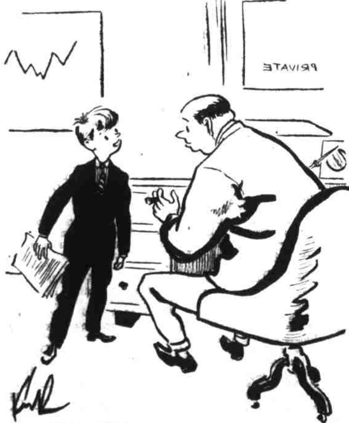
"My girl friend is dropping in later. I wonder if you'd find occasion to call me T. L.?"