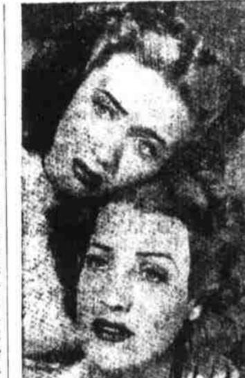
Jeanette MacDonald and singing starlet Jane Powell as mother and daughter in MGM's technicolor musical romance, "Three Daring Daughters," opening at the Strand theatre Sunday, April 25.

She was a sweet, soft-voiced little lady of quiet culture and restrained refinement, whose story undoubtedly never will have a finale in my memory, just one of a