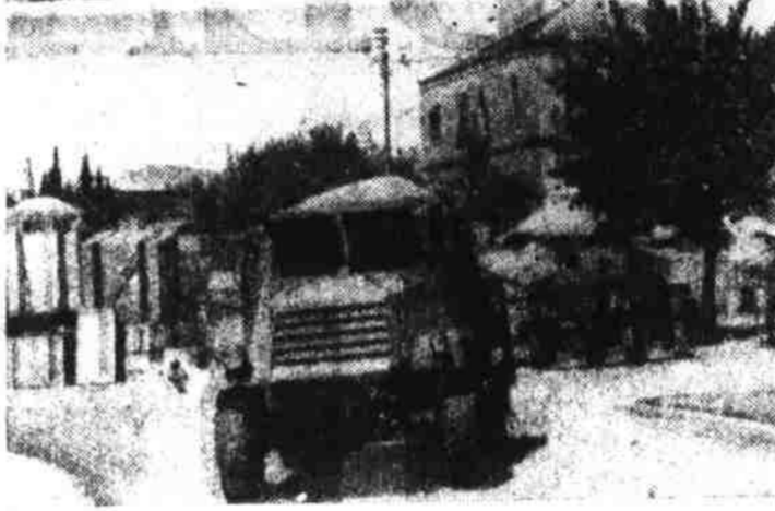
MEMBERS OF HAGANAH, the Jewish army, (top) climb Mount Kastel over rubble of the destroyed town after forcing a large Arab force to retreat. This important point, which has changed hands several times, overlooks the highway over which food convoys must pass to Jerusalem. Bottom, British armored cars prepare to convoy truckloads of food over the vital road which leads to the besieged Holy City.