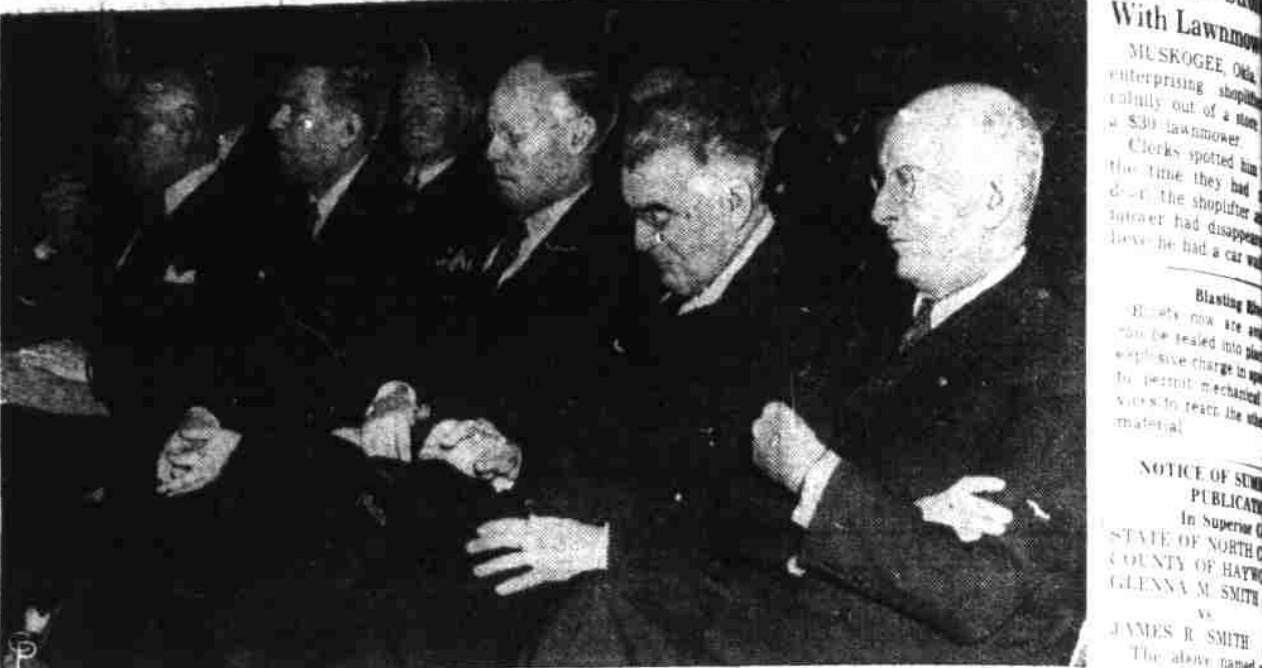
ATTENDING THE HUGE RALLY IN NEW YORK which saluted the new Jewish State of Israel are (l. to r.): New York's former Gov. Herbert H. Lehman; New York City's Mayor William O'Dwyer; Sen. Robert Taft (R-Ohio); Dr. Abba Hillel Silver, U. S. chairman of the Jewish Agency, and former Treasury Secretary Henry Morgenthau. An estimated 75,000 persons inside and outside Madison Square Garden heard speakers urge lifting the U. S. arms embargo to Palestine to enable the Jewish nation to defend itself.