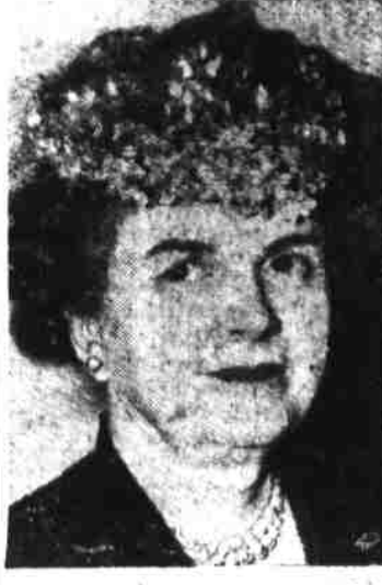
MRS. HENRY A. WALLACE