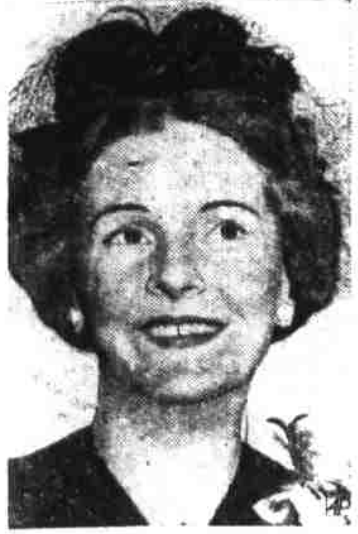
MRS. THOMAS E. DEWEY