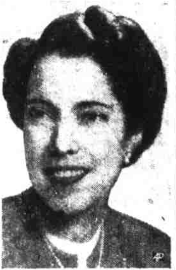
MRS. DOUGLAS MacARTHUR