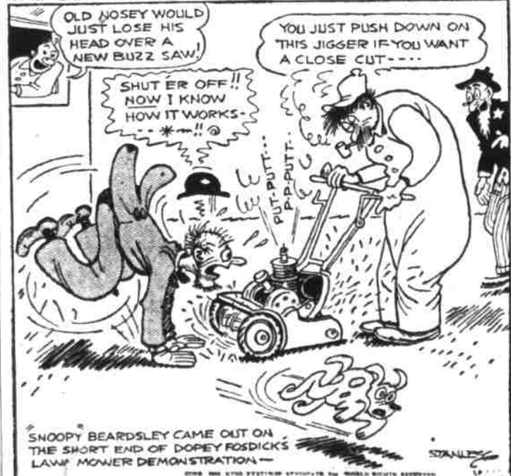
SHOOTY BEARDSLEY CAME OUT ON THE SHORT END OF DOPEY ROSKICK'S LAWN MOWER DEMONSTRATION.