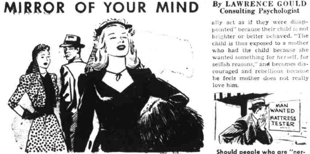
Does liking to wear black mean you are gloomy?

Answer: Only if you are a person in whose mind black is associated with gloom and mourning. While no explanation fits all cases, my guess would be that the average woman's addiction to black suits and dresses expresses the fairly universal conflict between the wish to attract attention and the feeling that she must be."modest." For while a black dress seems inuous and no one can acuse its wearer of a passion for colors, a beautiful woman or at least, hopes-that will be emphasized