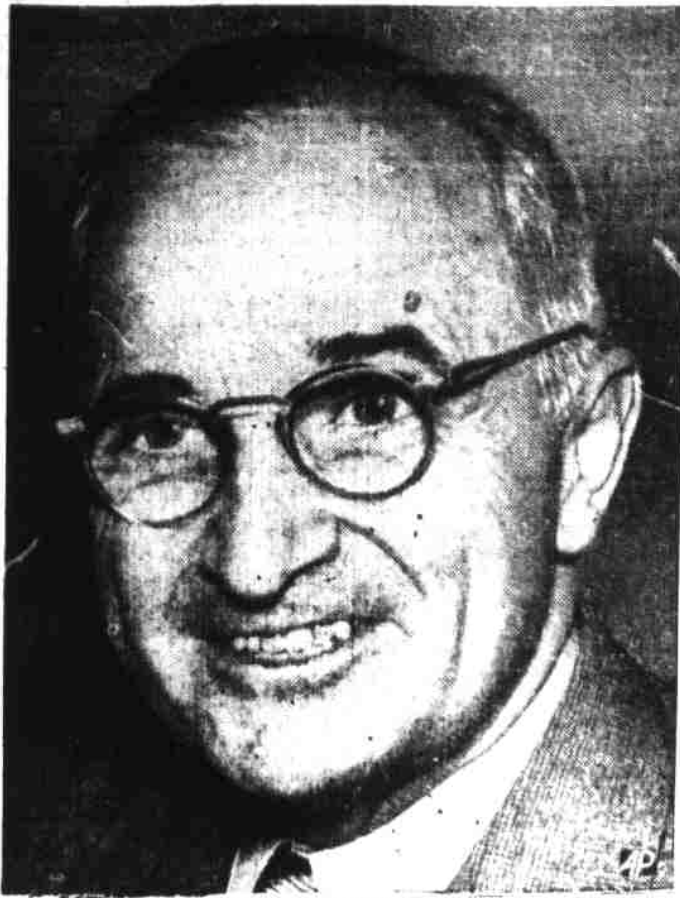
HARRY S. TRUMAN