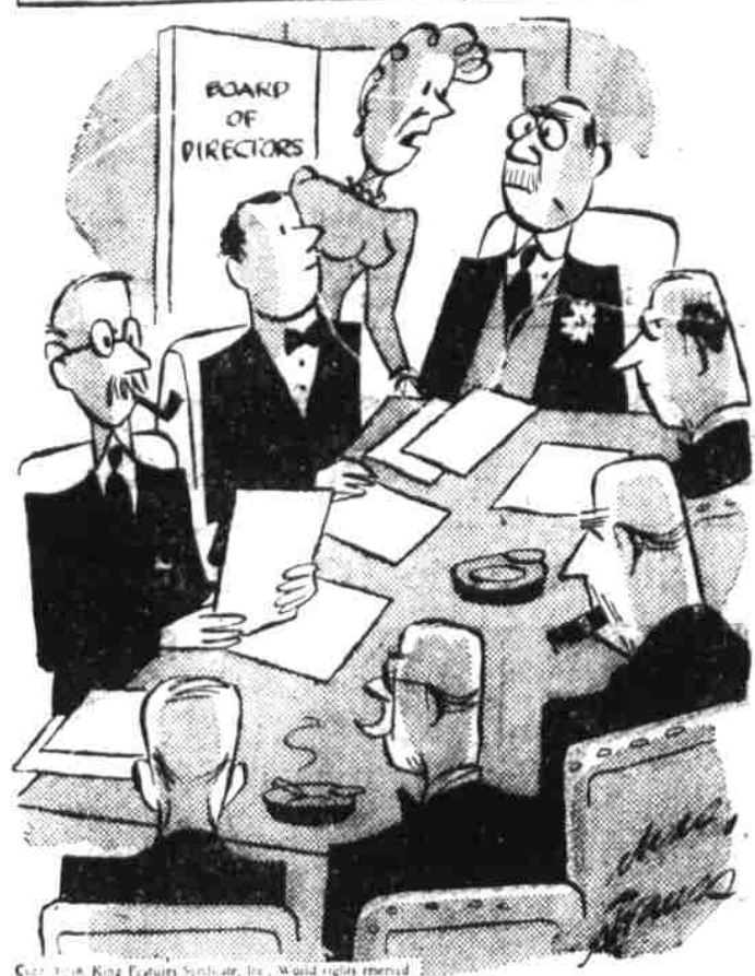
Your wife is on the phone. She wants to know where you put the egg beater after you finished up the dishes last night.