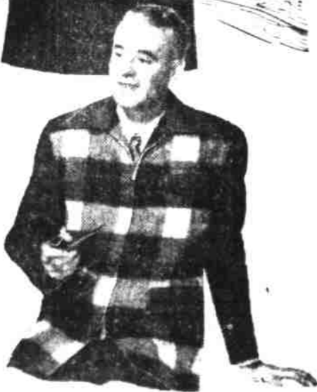
Exclusive "Bold Plaid" in 100% virgin wool with 100% virgin wool lining. Men's and boys' sizes.

EXCLUSIVE DESIGNS FROM... THE HOUSE OF Shanhouse