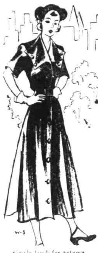
Simple frock for autumn.