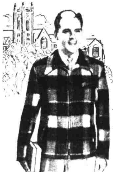
Beautifully tailored, sporty coats cut 100% virgin wool shirt. Five individual men's and boys' sizes.