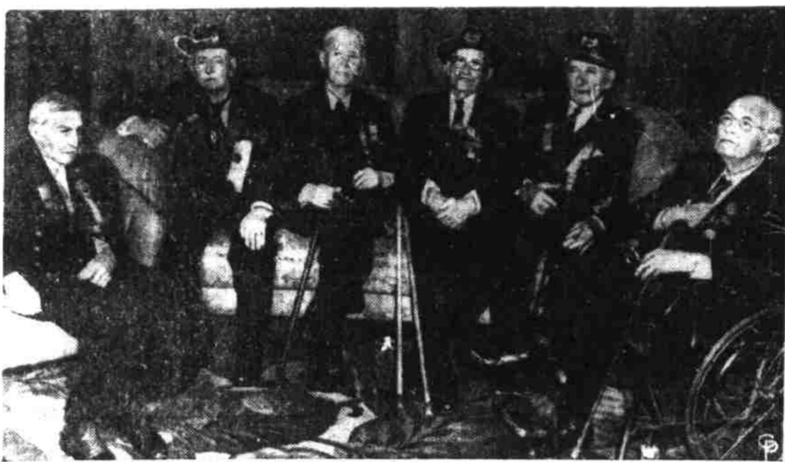
ATTENDING THE 82ND ENCAMPMENT of the Grand Army of the Republic, these six Union Army veterans brought a total of 617 years to the G.A.R. reunion in Grand Rapids, Mich.