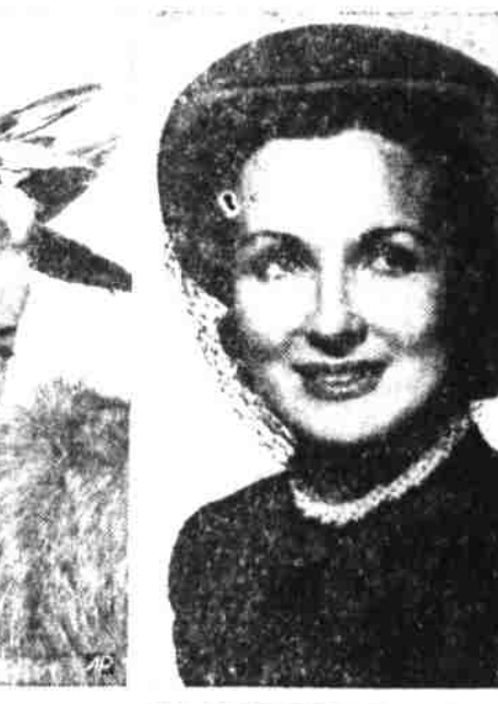
new head-fitting silhouette in Similar lines to that of the brade green feathers with clusters sey, batching veil, Germaine strands wrapped in plastic. Vittu.