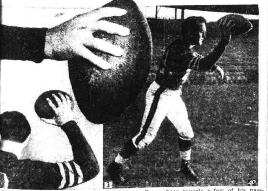
Great T formation quarterback of the Chicago Bears, Bear reveals a few of his pass-man grips the ball with his fingers across the lacing (1) and shows that fingers must grip the ball smoothly, not to the ear. When delivering the ball (2) the nose is parallel to the ground, says Luckman, and the ball delivered with a wrist snap. Legs comfortably with the weight balanced on the balls of the feet. Luckman, who this year is one of the finest of his 10 seasons with the Bears, recently turned author and the pictures from his book, "Passing for Touchdowns."

See Us For All Calibres Pistol, Rifle and Shotgun AMMUNITION and State Hunting and Fishing License —