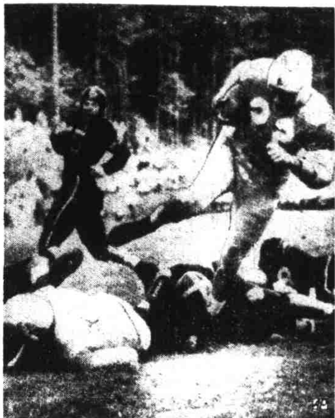
CHARLIE (CHOO-CHOO) JUSTICE, North Carolina back, jumps over pile of Wake Forest players to score touchdown in game between the state rivals at Wake Forest Saturday. It was the game's first score. Unbeaten North Carolina won, 28 to 6.