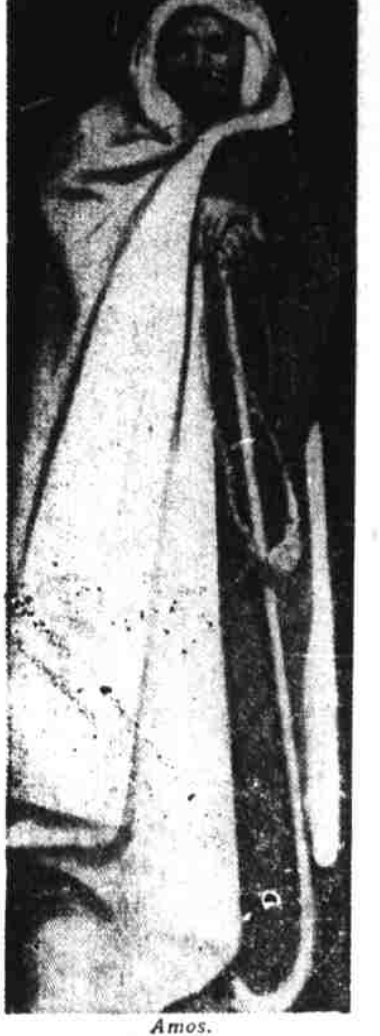
Amos. "Let justice roll down as waters, and righteousness as a mighty stream."—Amos 5:24.