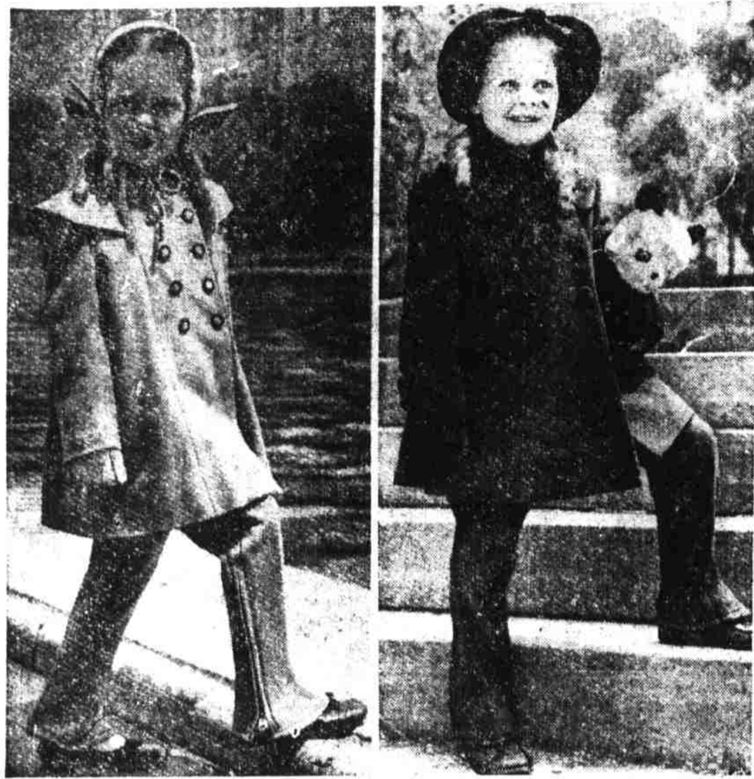
VICTORIAN CAPELETS . . . These are big news in 1949 coats for little sister as well as for her mother. Pictured are two favorite styles for fall, both in suede cloth by Hock-anum. Both have small velvet collars and double capelets.