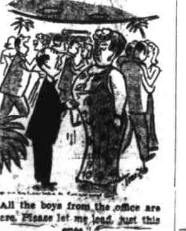
"All the boys from the office are here. Please let me load, just this once."