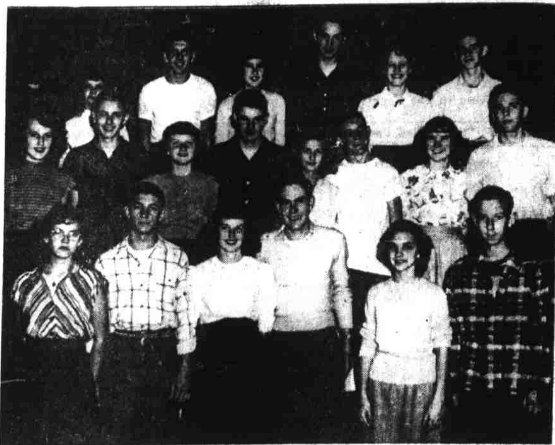
Shown here are members of the Enka Square Dance team which will be one of many teams taking part in the festivities here at the Armory Saturday night in the final phase of the Tobacco Harvest Festival program.